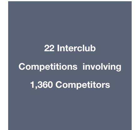
22 Interclub Competitions involving 1,360 Competitors