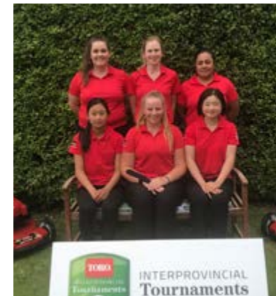
NZ Interprovincial Canterbury Women 2nd Canterbury Men 3rd