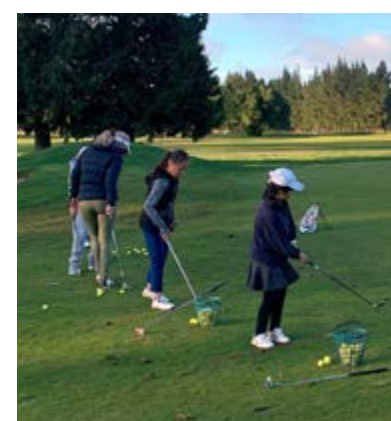
36 Development Squad Sessions Delivered