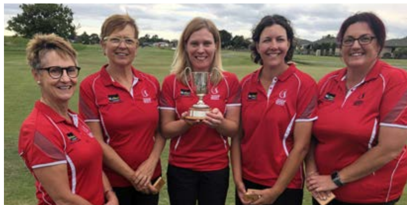
NZ Women's Masters Champions