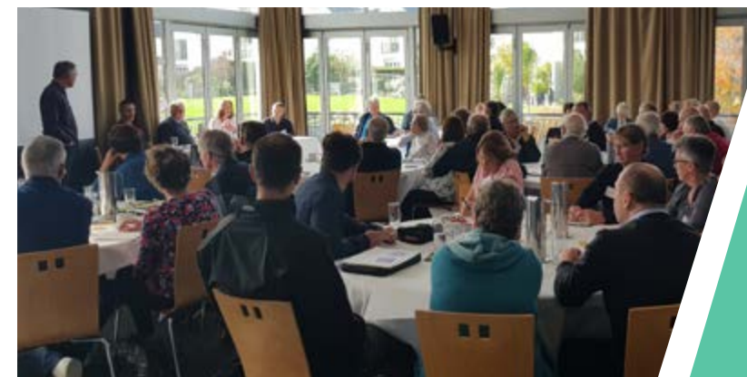
Canterbury Club Golf Forum attended by 80 People and 23 Clubs