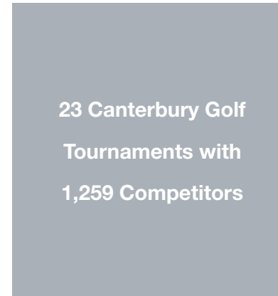
23 Canterbury Golf Tournaments with 1,259 Competitors