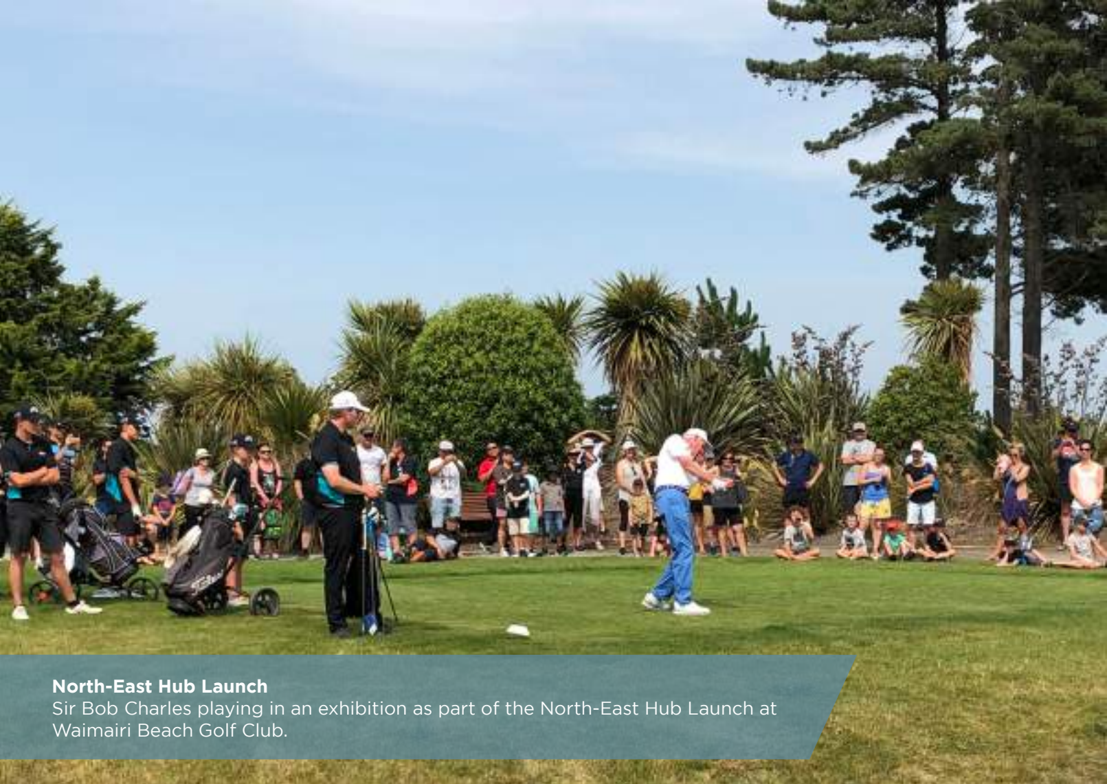
North-East Hub Launch Sir Bob Charles playing in an exhibition as part of the North-East Hub Launch at Waimairi Beach Golf Club.